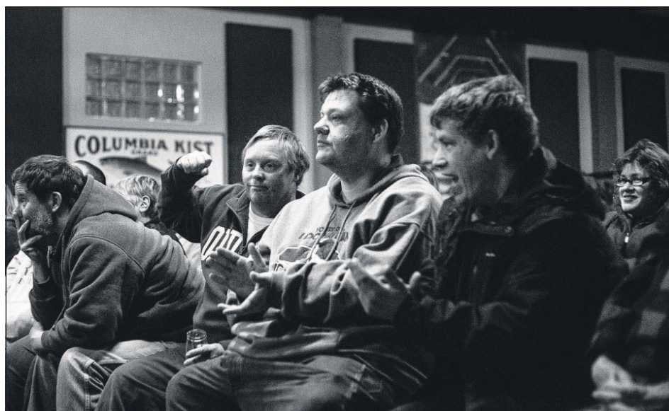
Fans cheer during the Perils on the Pole match last December.

It's often a painful dance as wrestlers fly off the ropes of the ring and land on slightly