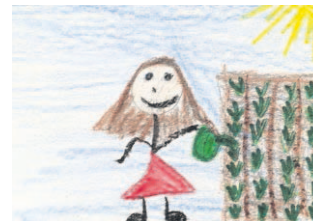
Old Town Framing will host a food and doodling event during art walk.

Stop in to see the newly remodeled building, and taste some edible art