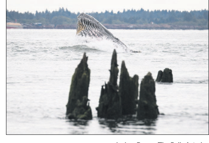
A humpback whale breaches near the Astoria Bridge Friday.