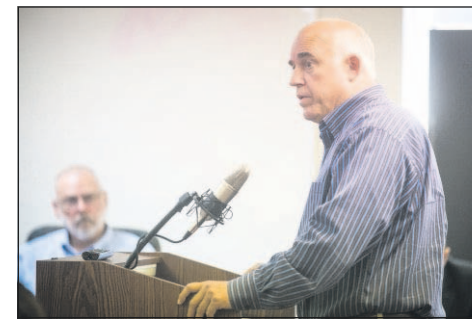
in the short-term, adding he and Orr have made available $350,000 to pay off Smithart's debts. Trabucco presented a vision of restoring the Riverwalk Inn and Sea-