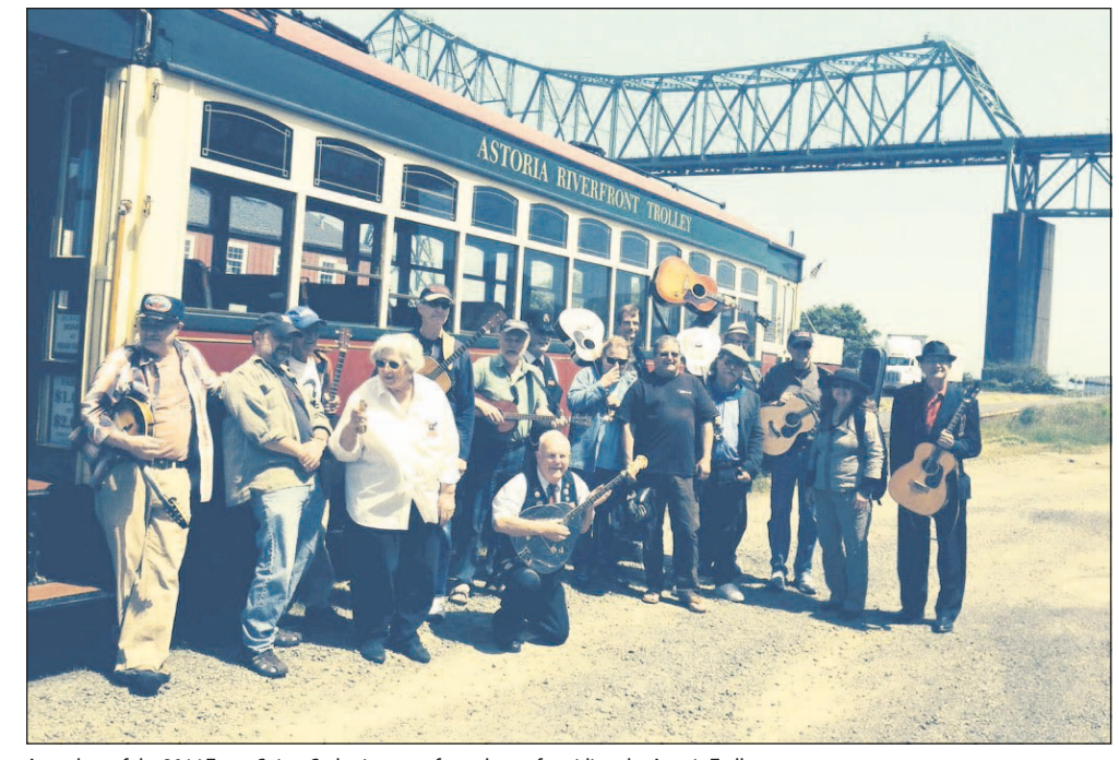
Attendees of the 2014 Tenor Guitar Gathering pose for a photo after riding the Astoria Trolley.

But don't be intimidated by this array of tunings and tenor-guitar insider lingo. Yes, if you're a musician, you'll find the workshops are friendly. informative and rockin'. The range includes how to build your own cigar-box electric guitar, an introduction to music from the Balkans, classic rock, honky tonk, and triad tunings. But for the general public, what this gathering means is three days of superlative and incomparable finger-pickin' magic, delivered by some of the best contemporary folk musicians in the country.