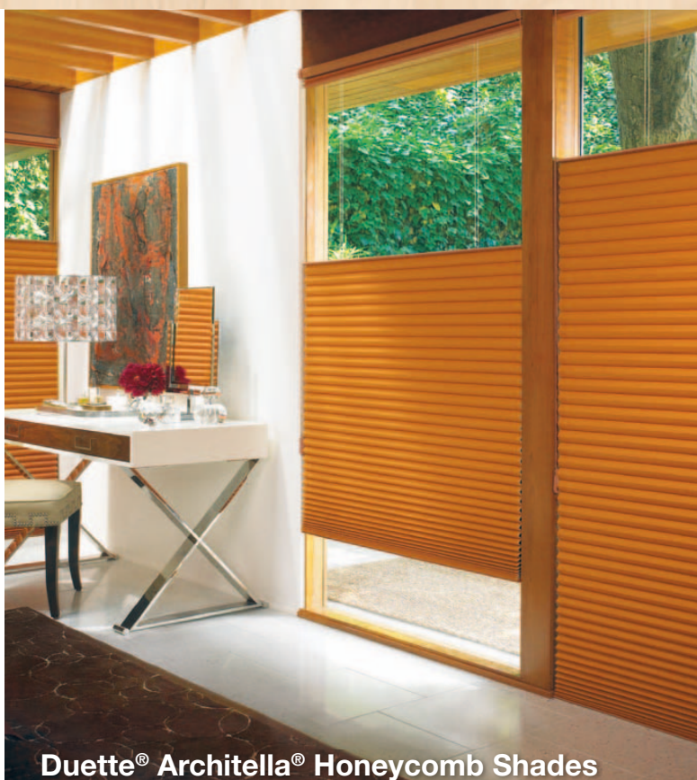
Duette® Architella® Honeycomb Shades