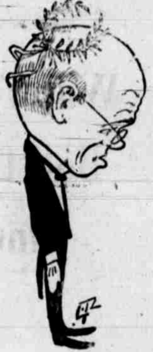
"Where the hair ought to grow."