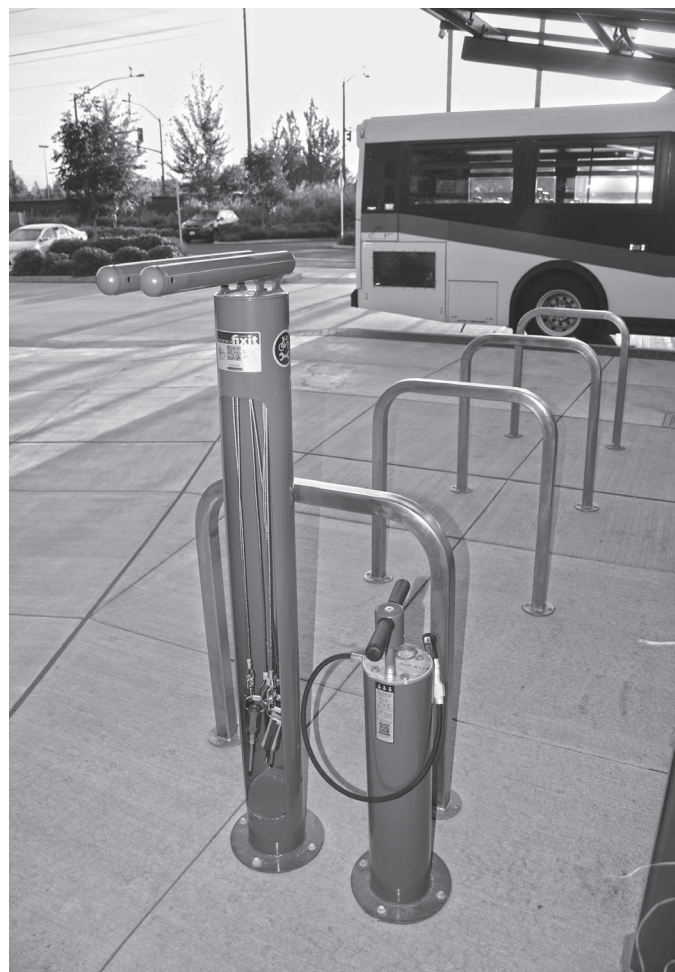
A new bike repair station, complete with tools and an air pump, is expected to be installed at Keizer Civic Center by August.

• Fisher also had an update on the potential for new wayfinding signs along the Salem-Keizer Parkway bike path. Fisher spoke with Dorothy Upton, an engineer