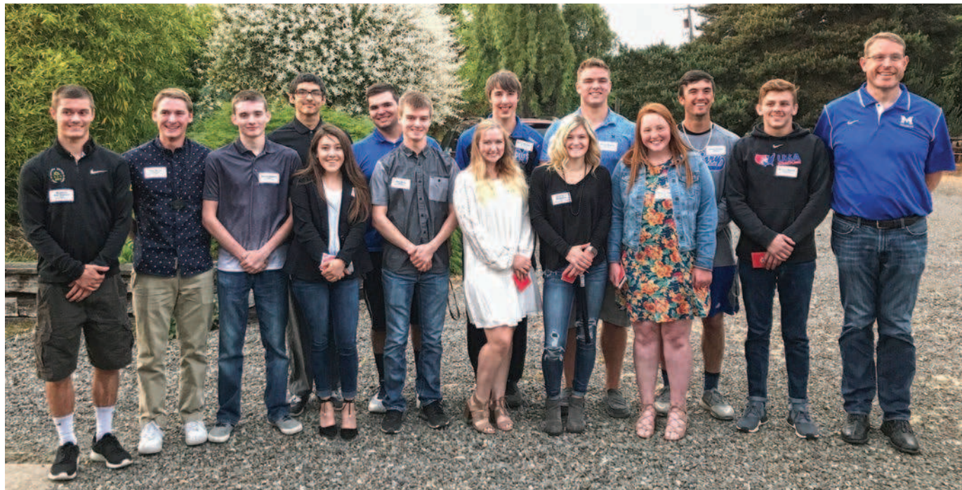
TOP LEFT: Attendees of the McNary Athletic Booster Club look over silent auction items at the annual auction and dinner on Saturday, June 3 at at Log House Garden at Willow Lake. TOP RIGHT: The booster club honored McNary seniors who are competing in a sport or JROTC in college. BOTTOM: More people participate in the auction, which combined with the dinner raised $35,000 for the booster club.