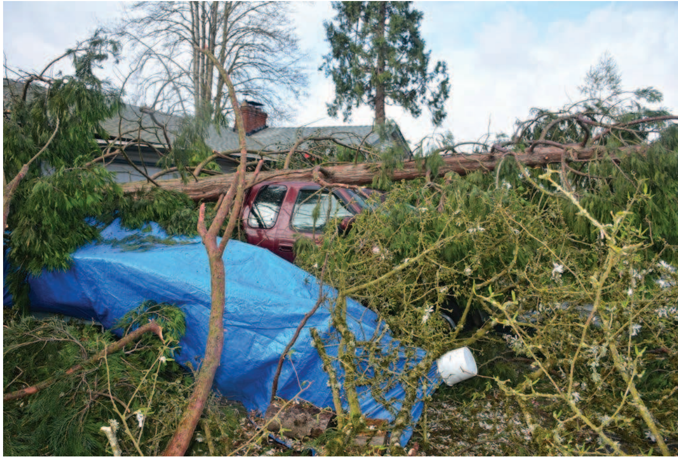
A tree came crashing down on top of a truck in the Gubser neighborhood during a windstorm Friday, April 7.