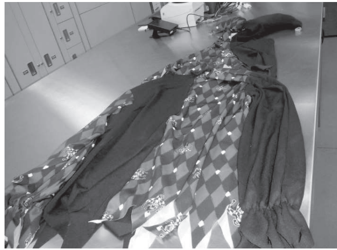
Keizer police confiscated a red and black jester’s outfit after two boys used it to scare a pair of women exiting the Salem Clinic urgent care office.

dressed in a black and red jester costume, and the other male subject who was involved in the incident were identified as 14-year old boys who both reside in Keizer. Both subjects cooperated with the investigation and admitted they were trying to scare the two victims as part of a prank that has been widely shared on social media.