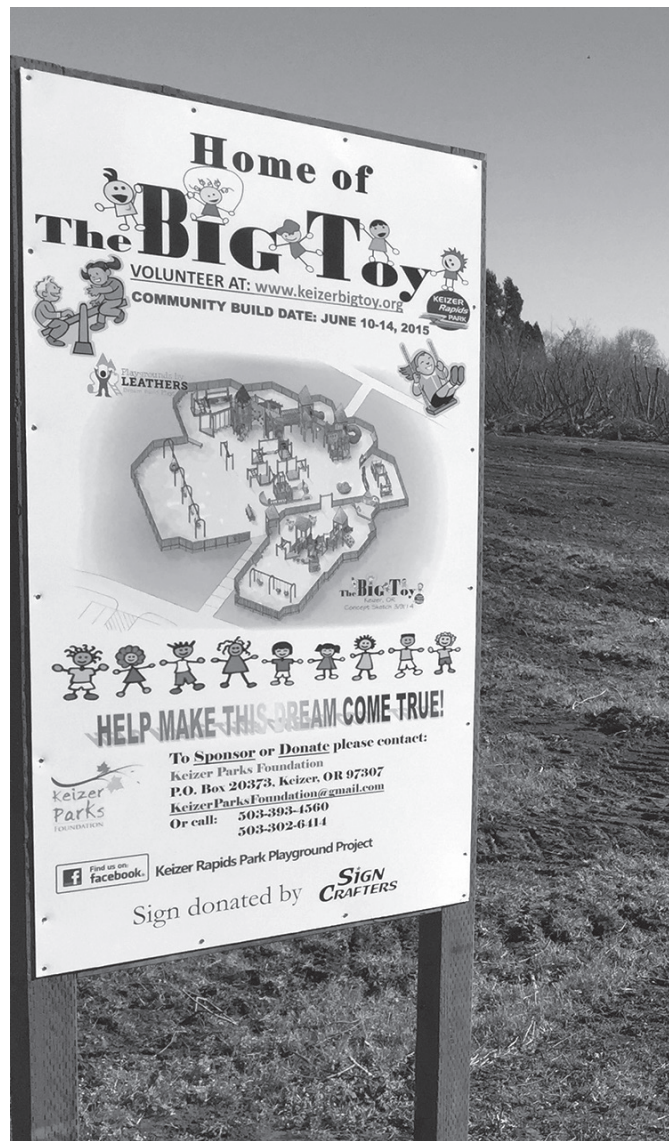
The Big Toy site in the orchards at Keizer Rapids Park will be a busy place a week from now.

Calm heads and quick thinking helped a Keizer woman escape Monday from being held at gunpoint at her home. Her ex-husband was arrested later, after a four hour stand-off with police.