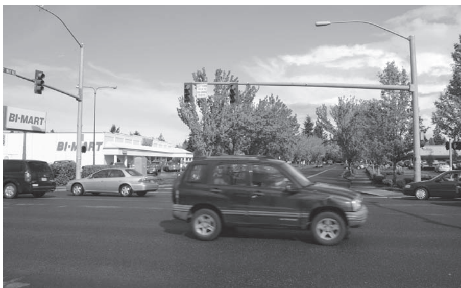
Keizer’s Traffic/Bikeways/Pedestrian Safety committee is looking at ways to improve Keizer intersections like the one at Orcutt Way and River Road N.