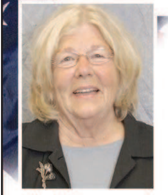
"I ask for your vote on your OTEC Ballot coming in the mail..."