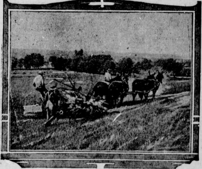
Success in This War Depends Largely on America's Next Wheat Cross

per cent under the same period in 1916. In September, October and November, under the supervision of the Food Administration, flour production was 114 per cent of the same period in 1916. What this means in the great national situation, with depleted domestic flour reserves and clamoring foreign buyers, can hardly be overemphasized, when movement of wheat into primary markets has been hardly