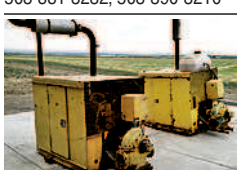
PORTABLE PUMP STATIONS $5500

Pivots: Good, various lengths, all brands & late models. No rust. Plus some pivot parts, and buried wire. Call Keizer, OR. 503-881-3232, 503-390-3210