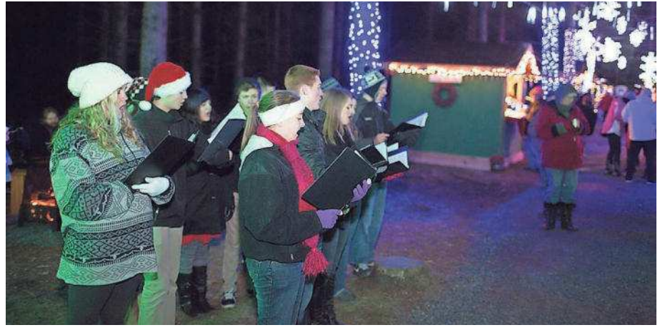
Sweet notes add to the light fantasy at Christmas in the Garden.