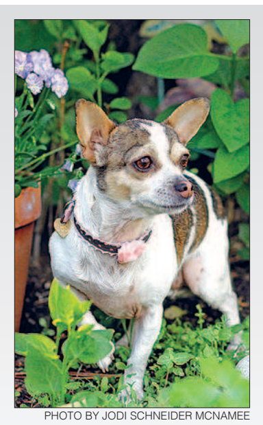
Mia is protected from fleas for the summer with Frontline.

Fido loves to play outdoors in the spring, so don't forget about your outside environment. Flea control in the outdoor area involves keeping your lawn mowed,